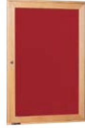
3052 DIRECTORY CABINET