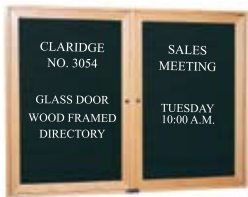
3054 DIRECTORY CABINET