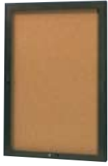
RIVAL BULLETIN BOARD CABINET (SHOWN WITH OPTIONAL BRONZE ANODIZE FINISH)