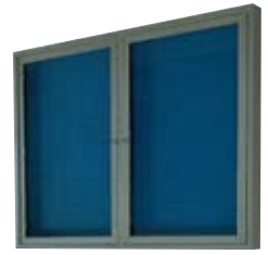
541 & 544 DIRECTORY CABINET