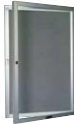
435 DIRECTORY CABINET