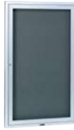
LARGE CONTEMPORARY SERIES BULLETIN BOARD CABINET