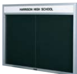
IMPERIAL SERIES BULLETIN BOARD CABINETS