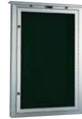
548 OUTDOOR DIRECTORY CABINET