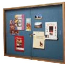
310 BULLETIN BOARD CABINET