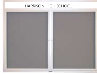
CONTEMPORARY BULLETIN BOARD CABINETS WITH HEADER PANEL