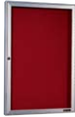
440 AND 441 DIRECTORY CABINETS