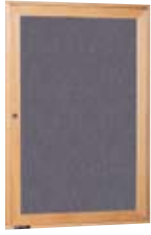
3070 WOOD FRAME BULLETIN BOARD CABINET