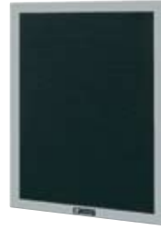
432 OPEN FACE DIRECTORY