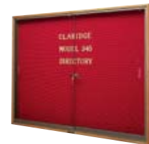
345 DIRECTORY CABINET