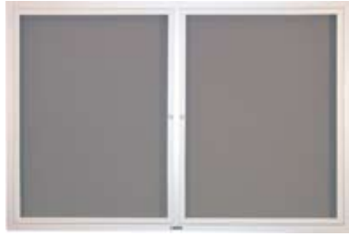
CONTEMPORARY BULLETIN BOARD CABINETS