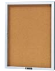
2300 ECONOMY BULLETIN OR DIRECTORY CABINET