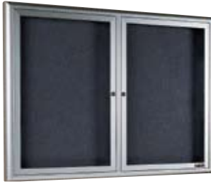
CLASSIC SERIES BULLETIN BOARD CABINET