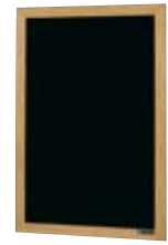
350 OPEN FACE DIRECTORY