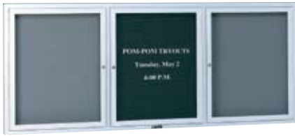
UNIVERSAL COMBINATION BULLETIN BOARD AND DIRECTORY CABINETS