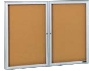
DELUXE BULLETIN BOARD CABINET