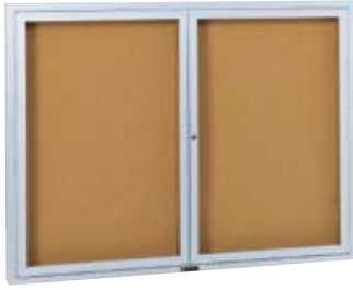
REVERE SERIES BULLETIN BOARD CABINET