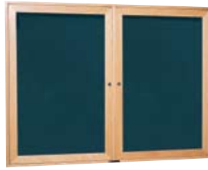
3080 WOOD FRAME BULLETIN BOARD CABINET