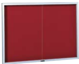
IMPERIAL SERIES DIRECTORY CABINETS