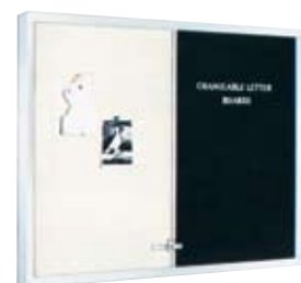
IMPERIAL SERIES COMBINATION DIRECTORY AND BULLETIN BOARD