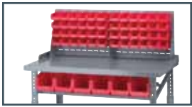
Accessory Package 1

Keep your work center organized with AkroBins® and cabinets. Choose from three accessory packages below or create your own combination from our extensive line of bins and containers (order custom combinations separately). Please specify one bin color per package: Red, Blue, Stone, or Yellow.