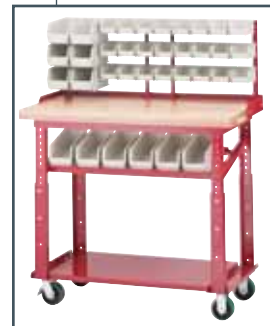
Work Table with Accessory Package

13 1/2"D x 37"W, tilted middle shelf for easy access to bins