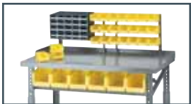
Accessory Package 3

Steel work surface extends 1 1/2" on front and sides to accommodate a vise or clamps (Hardwood extends 2")