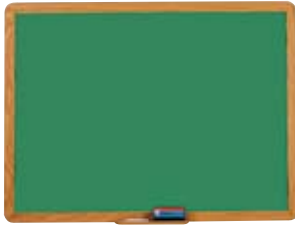
2900 SERIES CHALKBOARD – 1-3/4" FLAT FACE TRIM, RADIUS CORNERS