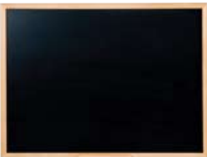
110 SERIES – 1-7/16" FACE TRIM TRADITIONAL STYLE