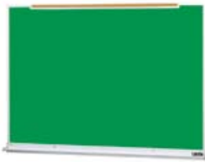
800 SERIES TYPE A – 5/8" FACE TRIM