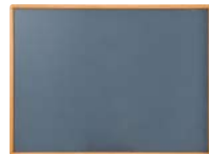
2500 SERIES CHALKBOARD – 1" BULLNOSE FACE TRIM, RADIUS CORNERS