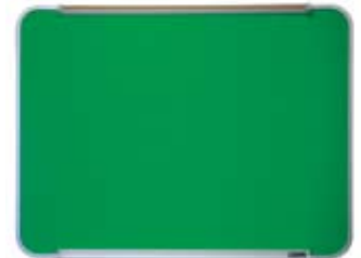
1200 SERIES – 5/8" FACE TRIM