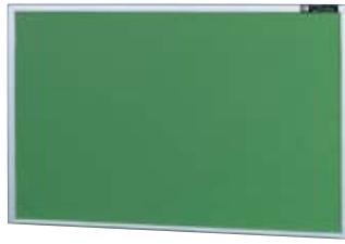
AS SERIES – 5/8" FACE TRIM