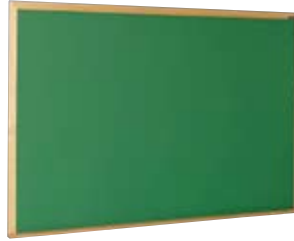
1600 SERIES – 1-3/4" FLAT FACE TRIM