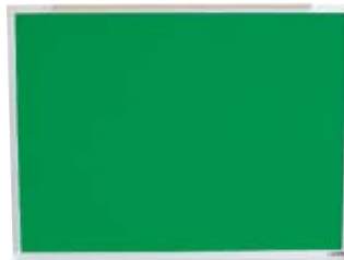
1300 SERIES – 1-1/4" FACE TRIM