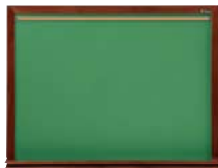
210 SERIES – 2" ANGLE FACE TRIM WITH BLACK ACCENT (SHOWN WITH OPTIONAL MAP RAIL)