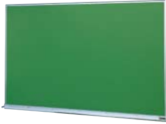
1700 SERIES – 5/8" FACE TRIM